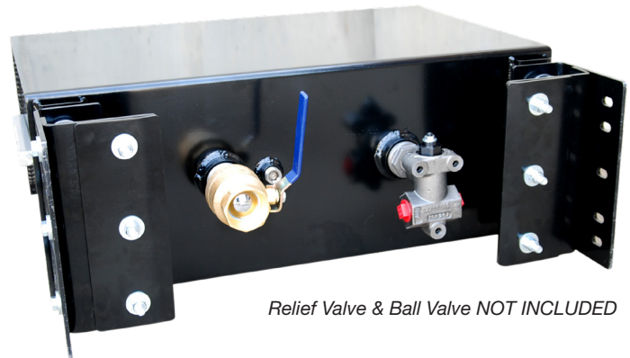
Relief Valve & Ball Valve NOT INCLUDED