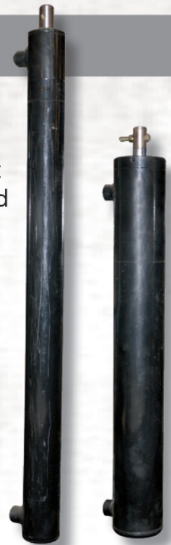
Image on the left is Single Stage, image on the right is Two Stage.

When you are looking for a little more depth for your soil samples, we offer our 42" two stage cylinder allowing for soil sample depths up to 36". This two stage cylinder is typically used in conjunction with the gas engine driven hydraulic power unit or a clutch pump kit. With a shorter retracted length, the two stage cylinder is more ergonomic because of the ability to mount the cylinder higher inside the vehicle. ( Clutch Pump kit is not available for every vehicle, please call for more information. )