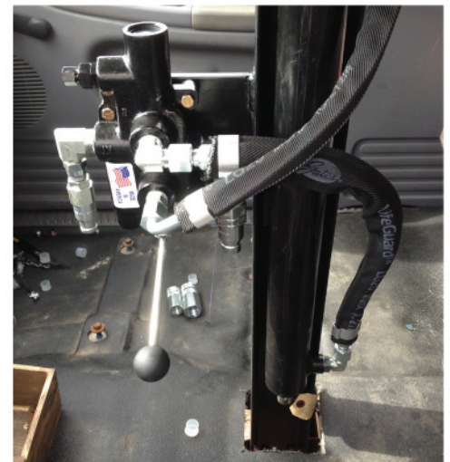
Manual Directional Valve Pictured

Made by Prince Hydraulics, this valve incorporates another relief valve along with a pressure release valve, which centers the directional valve to neutral once cylinder reaches its full retract position. For cylinder extension, the valve handle must be held in the down position; once handle is released, the cylinder movement stops.