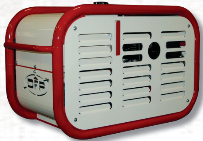
Ultimate Compaction Gas Power Unit pictured above.

Ultimate Compaction Gas Power Unit: When the Navigation & Compaction Kits are requested, DFP suggests using a much more user friendly power unit. The Ultimate Compaction Gas Power Unit has the same cycle speed as the Standard Gas Power Unit, but with a smaller foot print which allows for much easier transport and the ability to incorporate the electric valve into this power unit. Along with the smaller foot print, the added benefit of an electronic choke and computerized auto engine throttle.